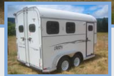
* Two Horse Model