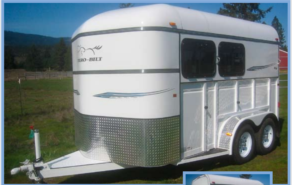
* Two Horse Model